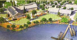
To Washington College waterfront campus